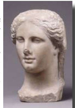
Head of Ptolemaic queen, possibly Arsinoë II Greek, Ptolemaic, ca. 270-250 B.C. Marble, h. 15 in. (38.1 cm)