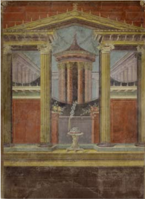
Frescoes from a cubiculum nocturnum (bedroom) Roman, Late Republican, ca. 50-40 B.C. From the villa of P. Fannius Synistor at Boscoreale, near Pompeii 8 ft. 8-1/2 in. x 10 ft. 11-1/2 in x 19 ft. 7-1/8 in. (265.4 x 334 x 583.9 cm)

I n our ongoing collaboration with the Metropolitan Museum of Art, St. Ignatius Parish is pleased to offer private guided tours of the new Greco-Roman Galleries on Saturday May 12, at 5:30 PM.