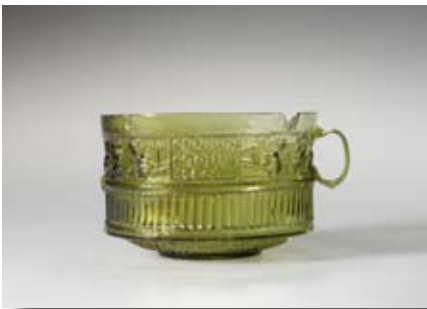
Cup signed by Ennion Roman, Julio-Claudian, 1st half of 1st century A.D. Mold-blown glass, h. 2-1/2 in. (6.4 cm)

A spectacular “museum-within-the-museum” for the display of its extraordinary collection of Hellenistic, Etruscan, South Italian and Roman art - much of it unseen in New York for generations - opened at The Metropolitan Museum of Art in April in its New Greek and Roman Galleries. After more than five years of construction, the long-awaited opening concludes a 15-year project for the complete redesign and reinstallation of the Museum’s superb collection of classical art. Returning to public view in the new space are thousands of long-stored works from the Metropolitan’s collection, which is considered one of the finest in the world. The centerpiece of the New Greek and Roman Galleries is the majestic Leon Levy and Shelby White Court - a monumental, peristyle court for the display of Hellenistic and Roman art, with a soaring two-story atrium.