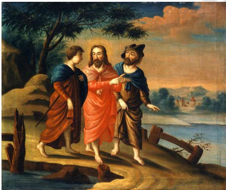
Anonymous American 18th Century American Christ on the Road to Emmaus , c.1725/1730

The highlight of my journey of faith was my Baptism and Confirmation at the Easter Vigil. I was now officially Catholic and could receive the Eucharist. I was overjoyed at sharing the experience with the whole group, the Parish community and my family. I can't properly put into words the feeling of welcome and warmth I felt when our entire group was applauded by the Parish. It was the end of our formal instruction, but the beginning of a lifelong journey of faith in Christ.