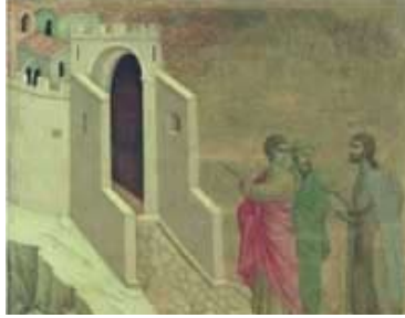
In their loss, Christ walked with them.

An evening for learning and experiencing support in grieving