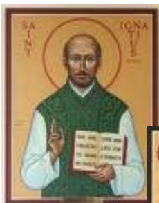
St. Ignatius of Loyola

SPACE IS LIMITED - PLEASE RSVP TO: rsvp@stignatiusloyola.org