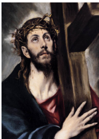
Christ Carrying the Cross. El Greco. 1580.