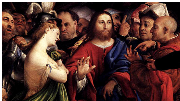
The Adulterous Woman. Lorenzo Lotto. 1527–1529.