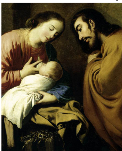
The Holy Family. Francisco de Zurbarán. 1659.

“To give...hope means more than simply acknowledging the centrality of the human person; it also implies nurturing the gifts of each man and woman. It means investing in individuals and in those settings in which their talents are shaped and flourish.