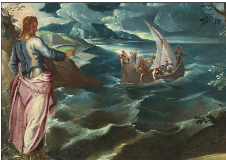
Christ at the Sea of Galilee. Tintoretto. 1575–1580.

We all know that it is not a good thing when a family rarely eats together due to individual schedules that do not allow for it. In the same way, it is not a good thing when individuals feel they can pray on their own, or seek God on their own terms. Jesus was quite definite