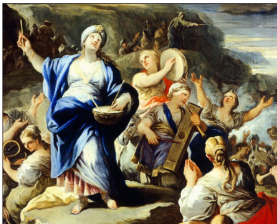
Song of Miriam . Luca Giordano. c. 1687.

Did you ever think of your body as a musical instrument? When you sing you are a musical instrument. My job here at St. Ignatius is to encourage people to sing. I can give you many reasons to sing during Mass. Here are a few: The verb "to sing" is one of the most frequently used words in the Bible. Christian liturgy in ancient times was always sung. Again and again the Bible and the Catholic Church instruct us to sing. Science has proven that singing is good for your health. Singing releases endorphins which make human beings happy. That said, there are many people who don't or won't sing, for whatever personal reason they might have. Try singing. You'll feel better. And singing helps keeps you young.