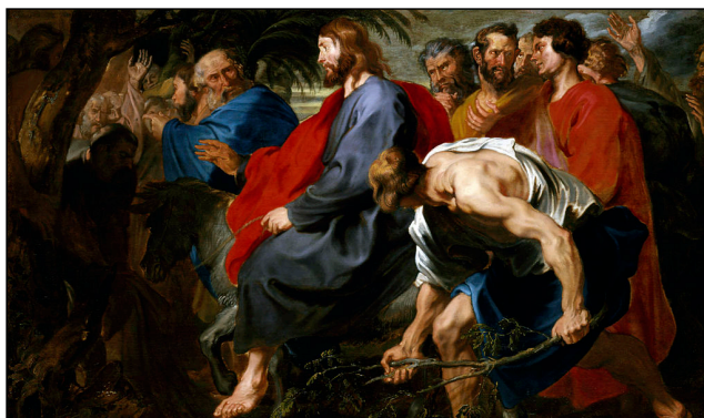
Entry of Christ into Jerusalem. Anthony van Dyck. 1617.