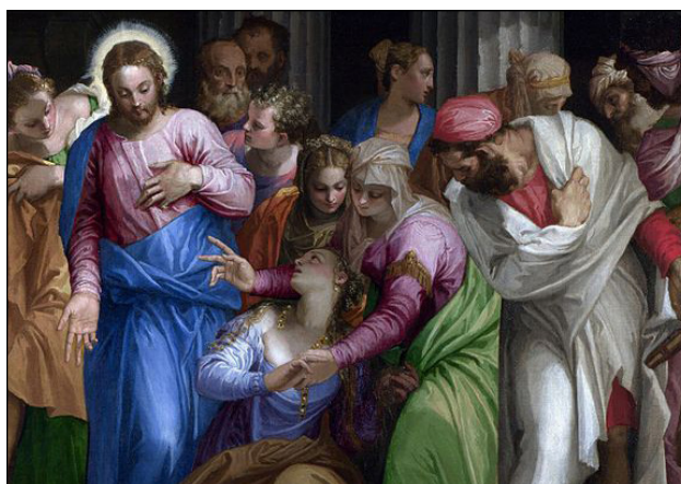
The Conversion of Mary Magdalene. Paolo Veronese. 1548.