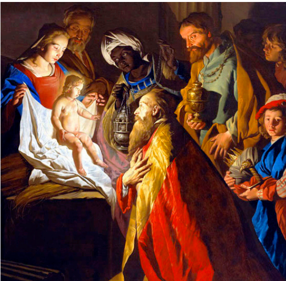
L'Adoration des mages. Mathias Stomer. Between 1601 and 1650.

The beginning of Eliot's poem taught me to approach Ignatian contemplation with imaginative freedom. The ending, however, disillusioned me. The magus claims not to regret the journey. Still, his experience is shrouded in ambiguity. He had gone to witness a birth, but once arrived he could not shake the shadow of death. He had gone looking for assurance; instead, he was left with a profound sense of dislocation.