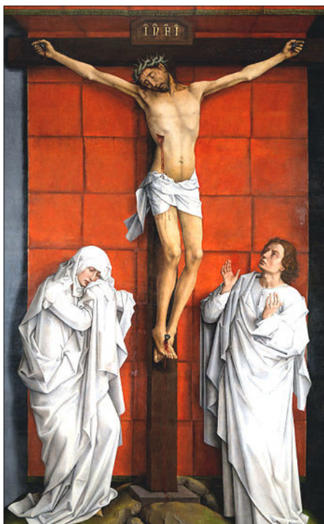
Christ on the Cross with Mary and St. John. Rogier van der Weyden. c. 1457–1464.

Each of us suffers loss—daily on a small scale, and periodically in ways that seem insurmountable. I know some of you who have lost a child, and it was of no relevance whether the child was an infant or an adult. Some have lost a beloved life partner or a parent to death. Many have gone through a divorce—myself included. These losses are real, and they change us. In varying degrees, we all are walking around with burdens of sorrow, and there is nothing wrong with that. I don't think the point of faith is to free us from the sorrow. That would be cheap escapism. Rather, our faith makes it possible, in time, to use our sorrow as fuel we convert into compassion and empathy for those around us.