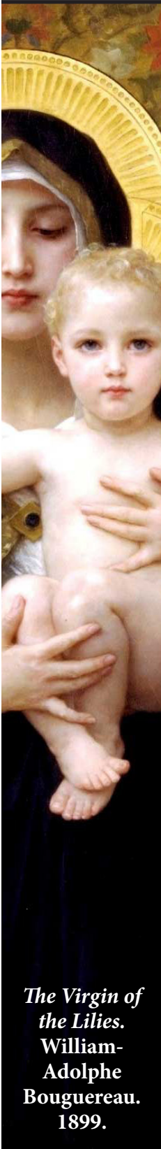
The Virgin of the Lilies. William- Adolphe Bouguereau. 1899.