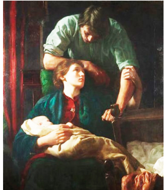
The Family. John Dickson Batten. 1886.

The official website of the Sagrada Família describes the basilica as a “symbolic expression in stone of the Christian faith. In this temple, an exaltation of the Family of Nazareth as a model for a united family, Christians, especially Roman Catholics, can recognize the tenets of their faith.”